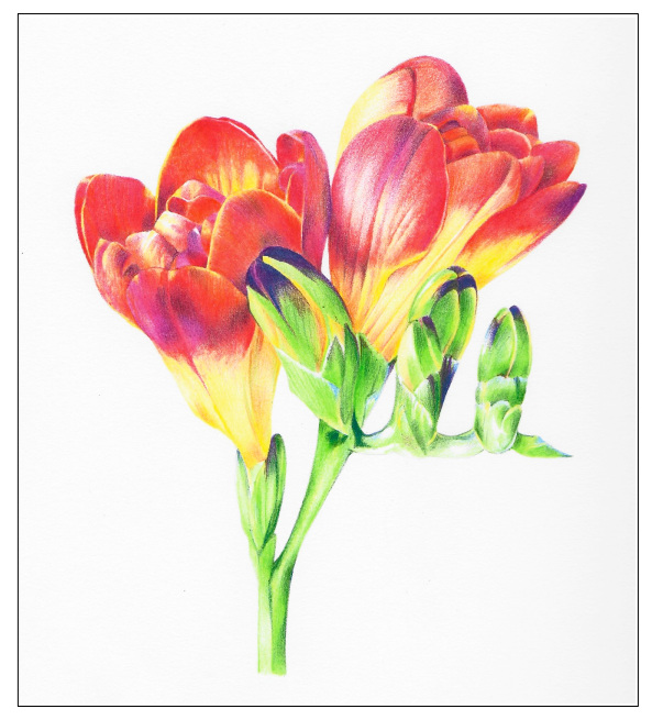
Use Prussian Blue to push the shadows even deeper on the tips of the buds and in the small folds on the stems with a sharp point and medium pressure.