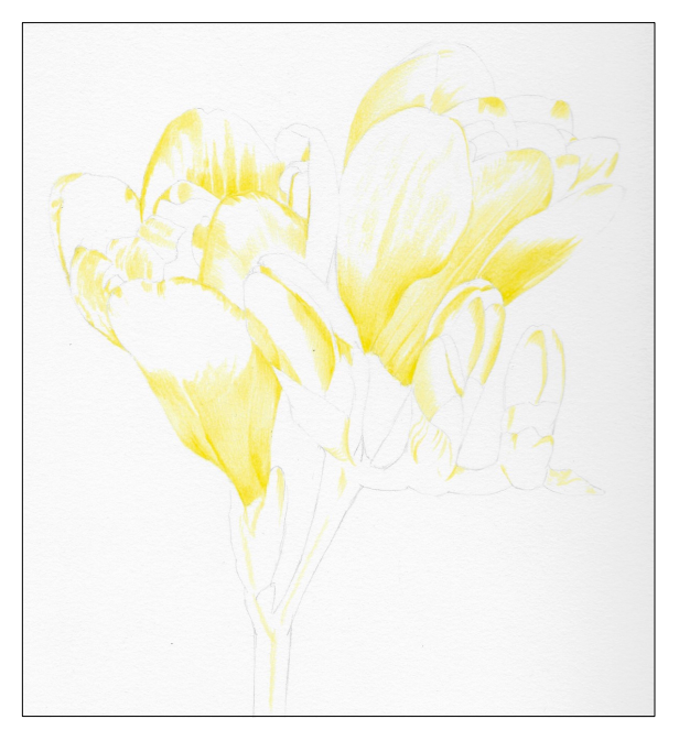
With Buttercup Yellow and a very sharp point, starting from the base of the flowers and a light pressure shade in the direction of the petal growth, add extra layers where the tone is deeper and greater in value instead of pressing harder.