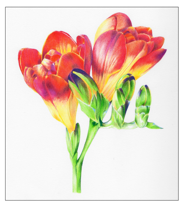
Use Brown Ochre to add shading to the inside of the freesias on the yellow sections to create a three dimensional effect. Add a touch of Brown Ochre to the buds also.

With Burnt Umber darken the shadow and depth on the purple tips on the buds.