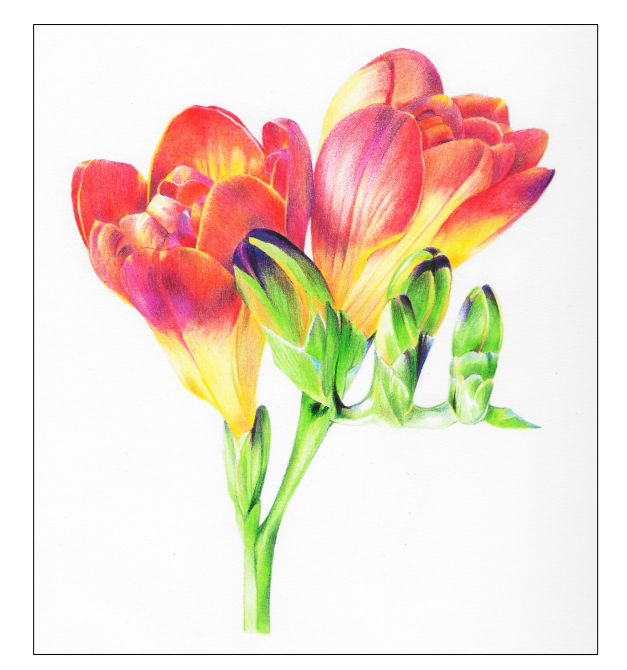
Use Ivory Black to add very slight touches of shadow to the darkest points of the shadows and tips of the buds and this will really make your drawing come alive!

With Burnt Umber darken the shadow and depth on the purple tips on the buds.