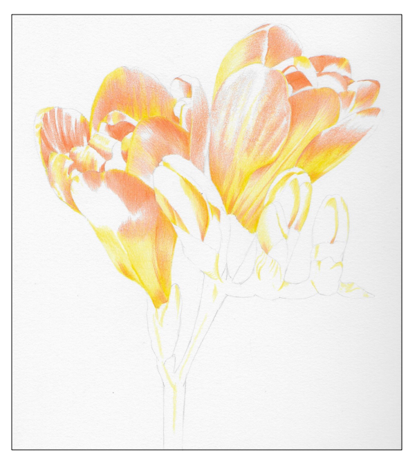
Use Deep Chrome to add in the 'under painting' to the freesias, this will show through the subsequent layers of transluscent coloured pencil and help achieve a three dimensional appearance. Vary the pressure where the colour is greater in depth but keep your pencil sharp at all times!