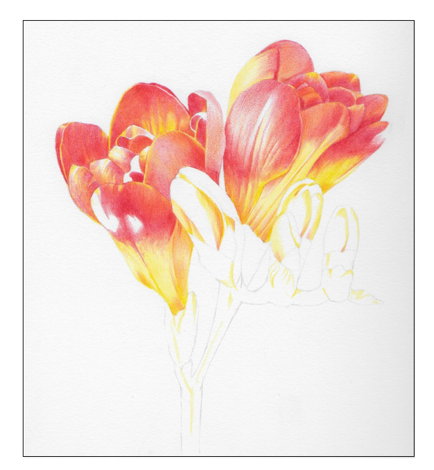
With Primary Red add a layer of pencil to each petal at a time starting with the side opposite to the hand that you use to draw to avoid smudging your art. Where the shadows are deeper red apply slightly more pressure and ad more layers of pencil with a sharp pencil to build up the pigment on the paper surface. Shade in the direction of the petal growth to form the shape of the flower.