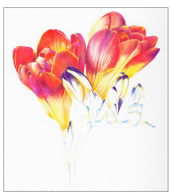
Use Spectrum Blue to very lightly add the pale blue points on to the stems of the freesias. They are very subtle so only need to be applied with a very light touch in light layers.

Use Imperial Purple to add touches of depth to the petals on the main freesias on the tips and the inner folds to create the illusion of depth. Use slightly more pressure on the buds and add the Imperial Purple on the tips following the shape and contour of the blooms.