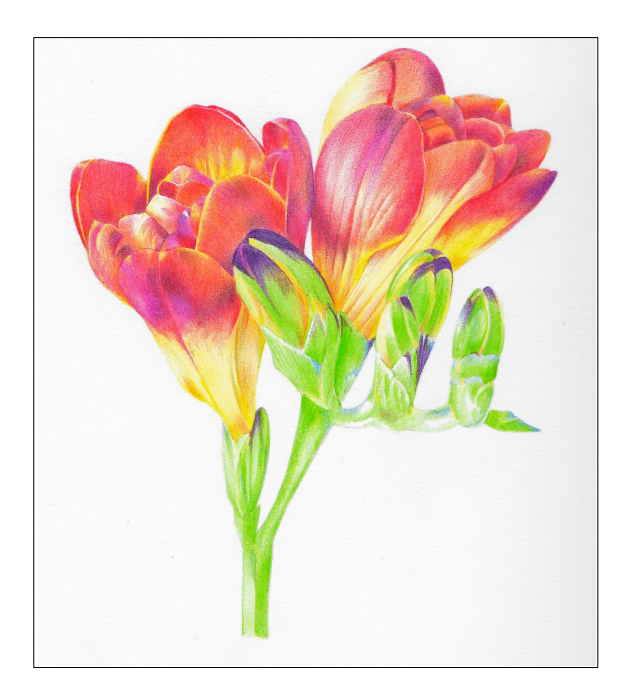
Use Grass Green in a medium pressure in the direct of the growth of the stem and the bud leaving areas for highlights, increase the pressure in the shadows keeping your pencil sharp.