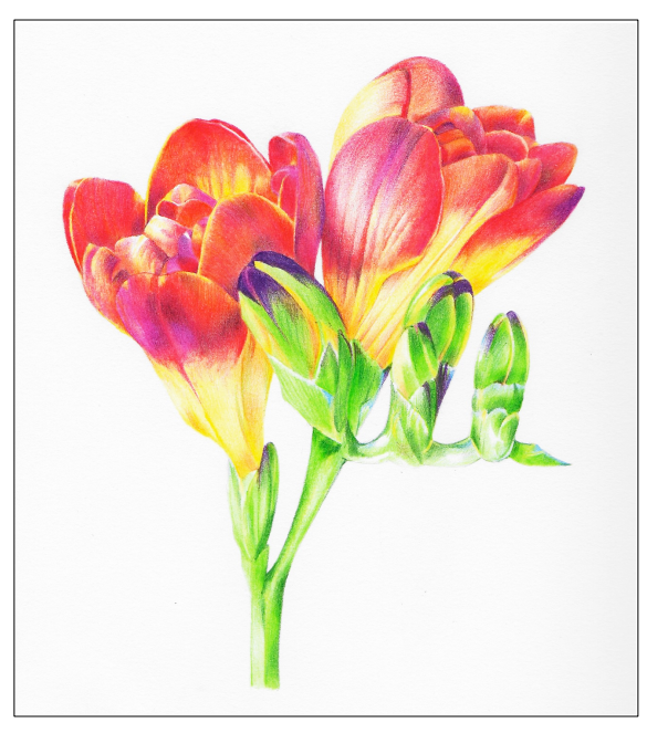
Use Sap Green to add shadows to the stems and the buds. Use a firm pressure and a sharp point to create depth and keep your lines crisp.